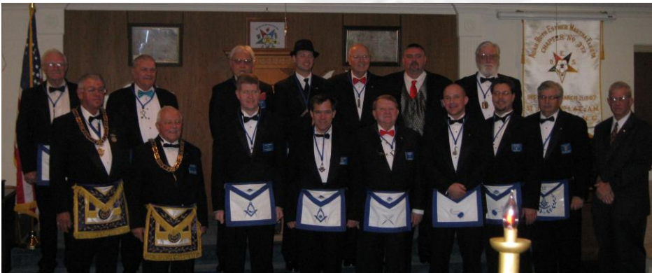
The newly installed officers of St. John's Lodge #1 for 2012!