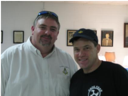
Long lost twins?